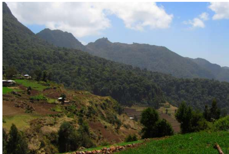
Ankober-Zego Natural Forest