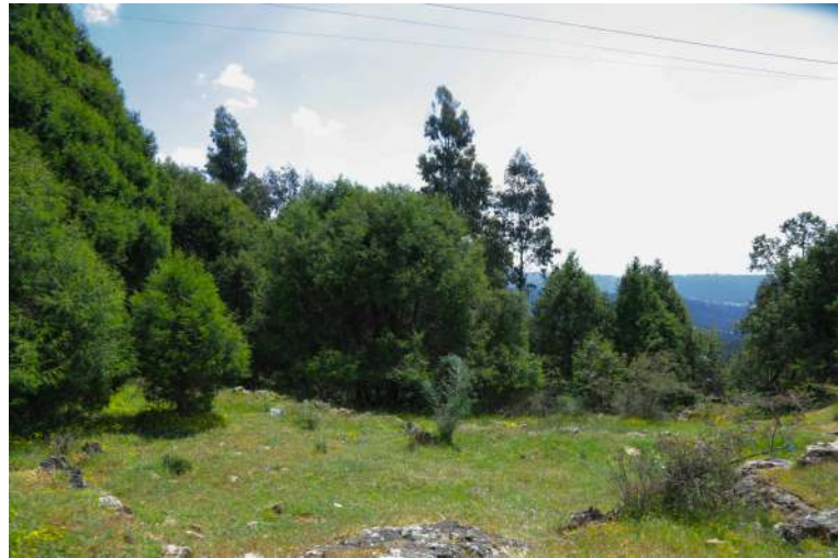
Entoto Natural Park

To this list was added this year a role in the project to restore the Dessie Museum, a three year-project being led by the British Council with the UK Government Department for Digital, Culture, Media and Sport and with appropriate Ethiopian government bodies.