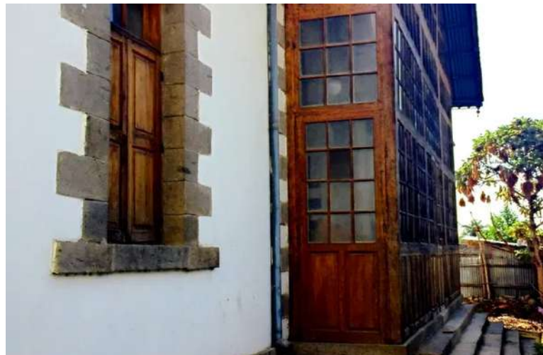
Trust's headquarters building